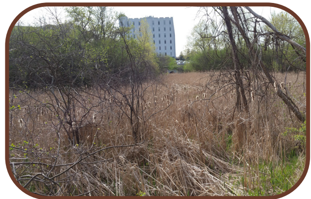
Existing wetland conditions