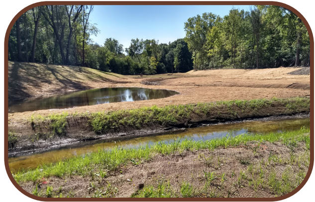
New stream and pocket floodplain wetlands