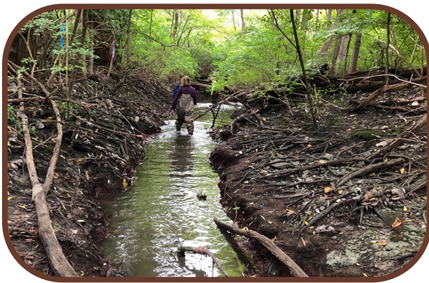
Existing stream conditions